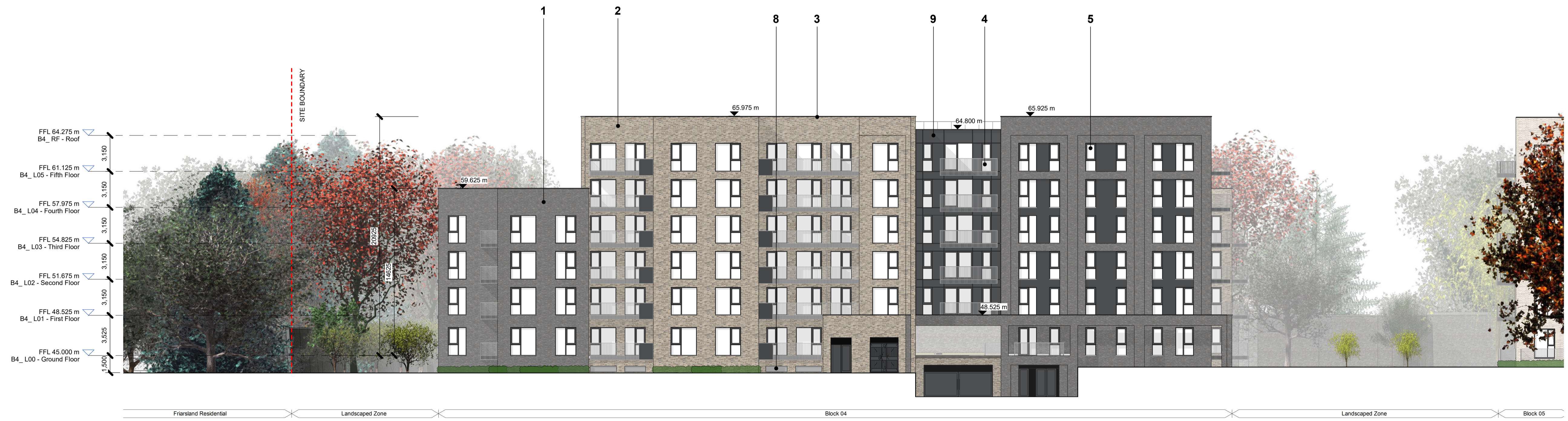
Block 04, North Elevation 1 : 200

Notes: - Do not scale from this drawing. Use figured dimensions in all cases. - Verify dimensions on site and report any discrepancies to the Architect immediately. - This drawing is to be read in conjunction with the Architect's Specification. - © This drawing is copyright and may only be reproduced with the Architect's permission.