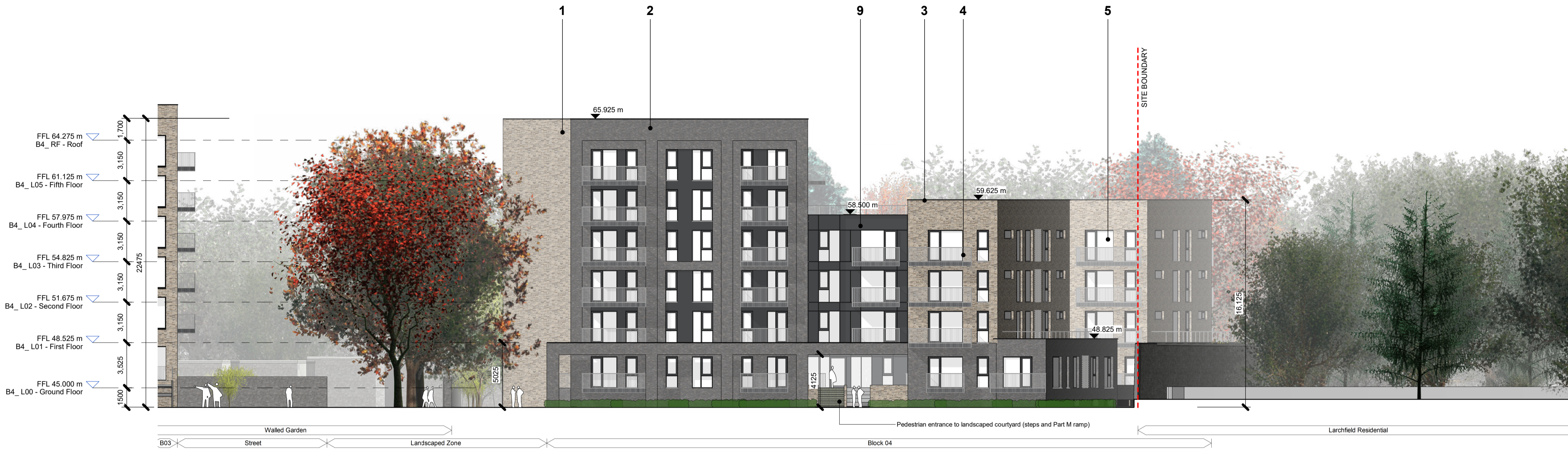
Block 04, West Elevation 1 : 200